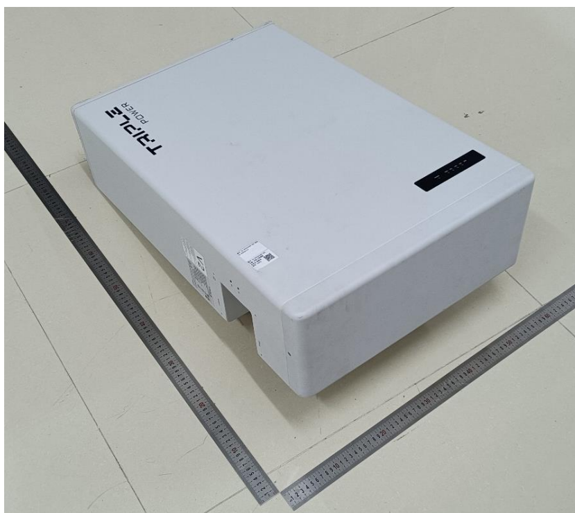
Picture 1 Side view of Rechargeable Li-ion Battery